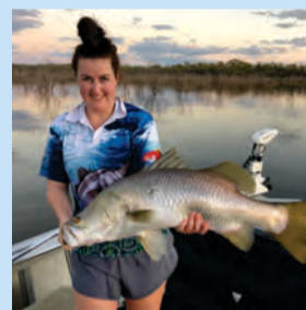
Catch a Barramundi