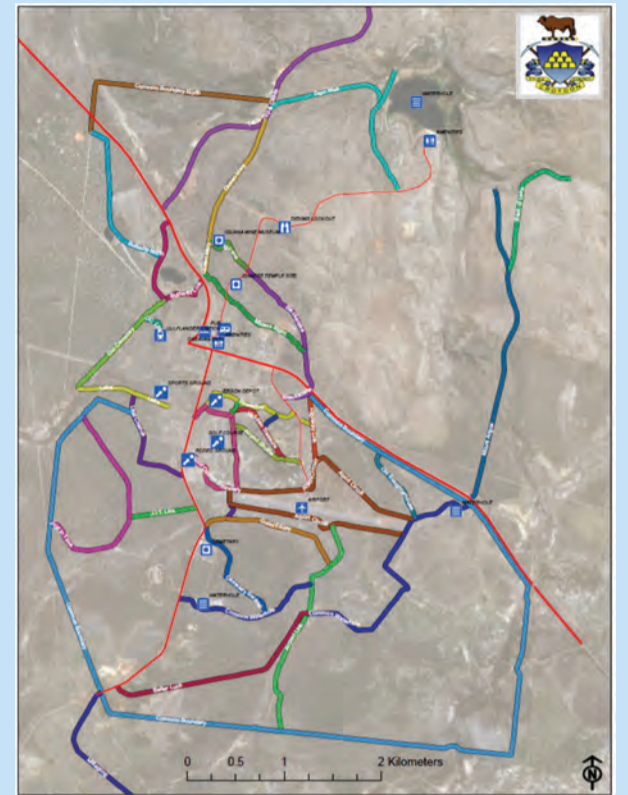
Trails to explore for mountain biking, bush walking, trail running and bird watching